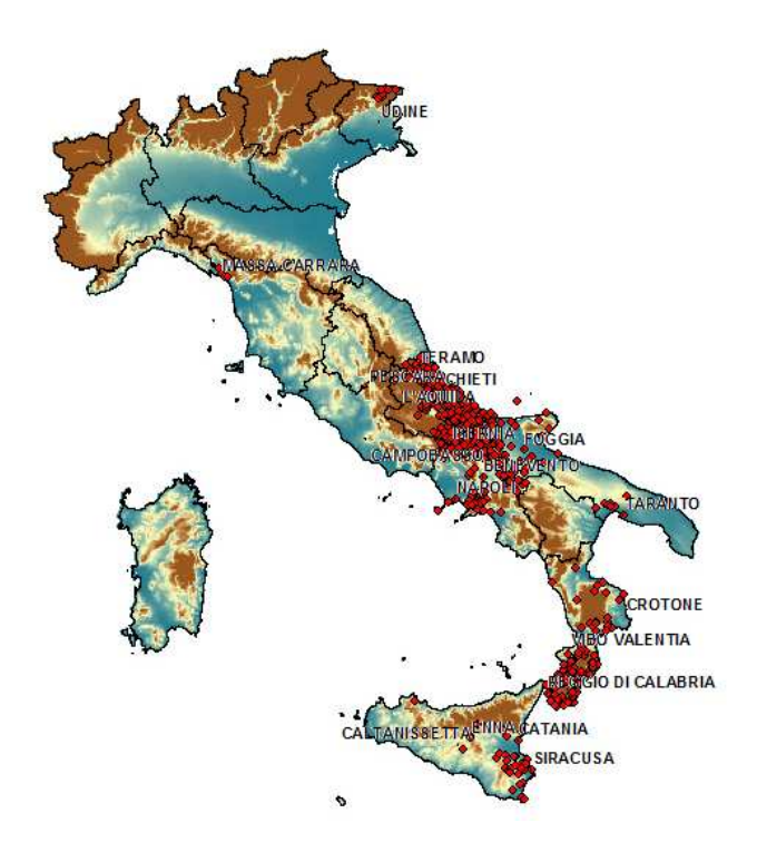
Fig. 3. Italian municipalities struck by floods in 2003.

On the other side, soil effects and damages severity is connected to factors like land use, processes dynamics and to the eventual presence, efficiency and functionality of protection works. Of course it is clear that generally a wider territorial distribution of settlements causes worse damages under the