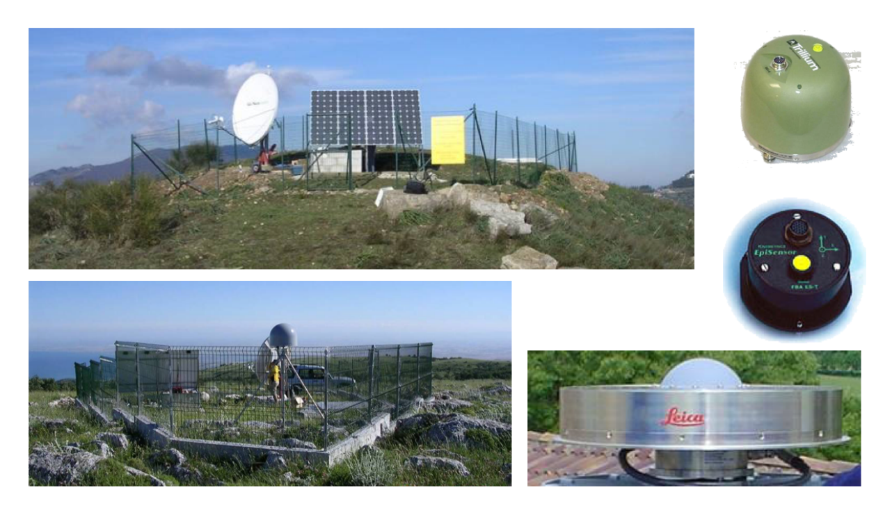
Figure 2. A site of the RSN-RING networks equipped with broad-band velocimeter, accelerometer and GPS antenna.