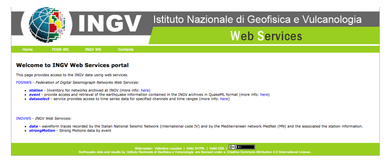
Figure 5. INGV web services at http://webservices.rm.ingv.it/.