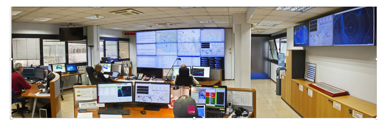
Figure 6. Surveillance, operational room in Rome.