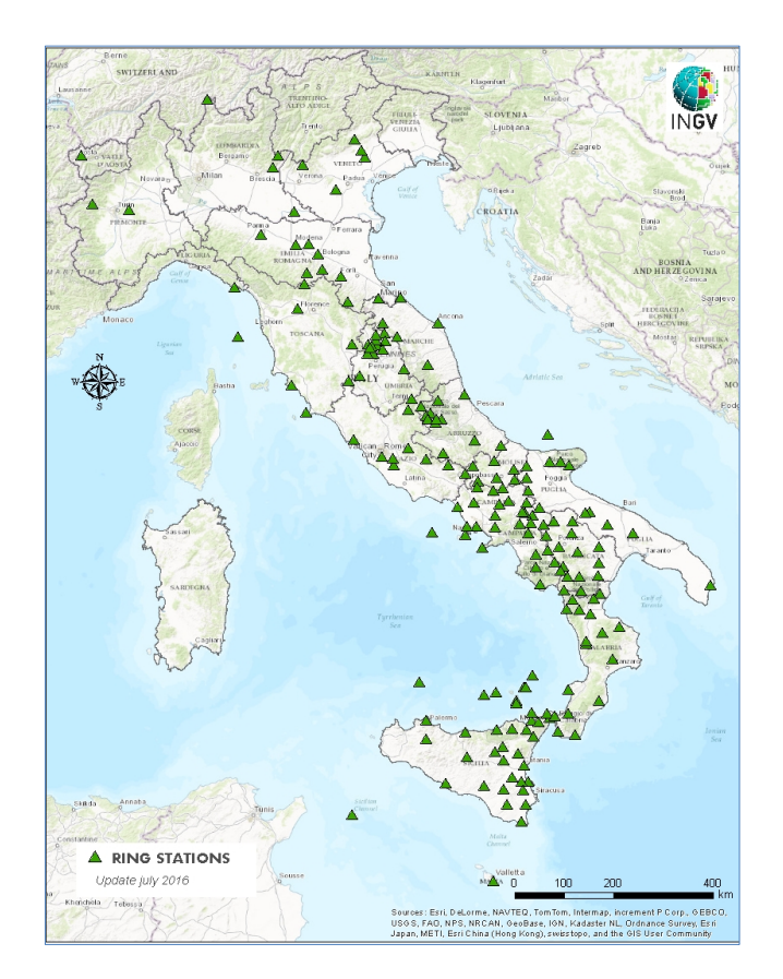
Figure 3. RING, the Italian GPS National network.

node of the federate archive, and develops and provides a series of web services to access, explore and download data and metadata contained in the archive (Fig. 5). EIDA nodes are data centers which collect and archive data from seismic networks. Networks contributing data to EIDA are listed in the ORFEUS EIDA network list (http://www.orfeus-eu. org/data/eida/networks/). Technically, EIDA is based on an underlying architecture developed by GFZ to provide transparent access to data of all nodes. Formally, EIDA is a special working group of ORFEUS – the organization that since 1987 started to promote digital seismology in Europe in all aspects, especially the research of seismic waves in a broad frequency range (so called "broad-band seismology").