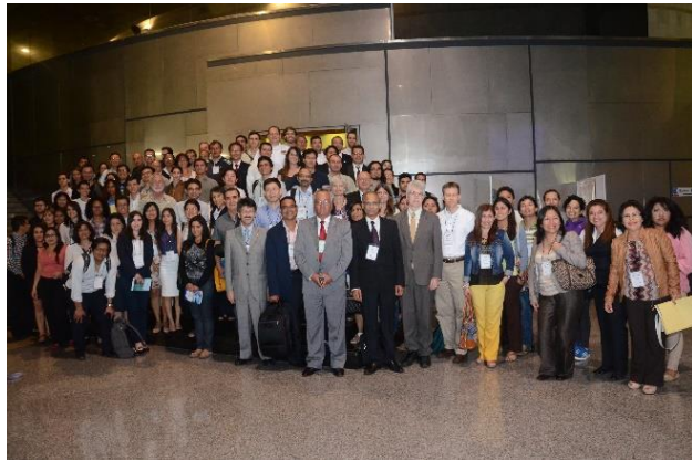
Figure 1. Two moments during the III International Conference on ENSO "Bridging the gaps between global ENSO science and regional processes: extremes and impacts", Guayaquil (Ecuador) 12–14 November 2014.

In the session on modeling of the processes related to ENSO it was pointed out that, despite the progress achieved in this matter, results of models still present substantial differences from the reality, because the difficulties for including the non-linear dynamic involved. It was mentioned that a way to improve models skill, besides to incorporate a more realistic representation of the ocean-atmosphere dynamic, is to move from the practice of adjustment models by compensating bias detected in validation, with statistical metric, to adjustment based on dynamic metrics instead. Regarding this, Bjerknes stability index was pointed out as a very useful tool to evaluate the skill of the models, and also it was proposed to use the heat flux feedback, controlled by the convection parameterization used in the model, as a key parameter for validation and adjustment.