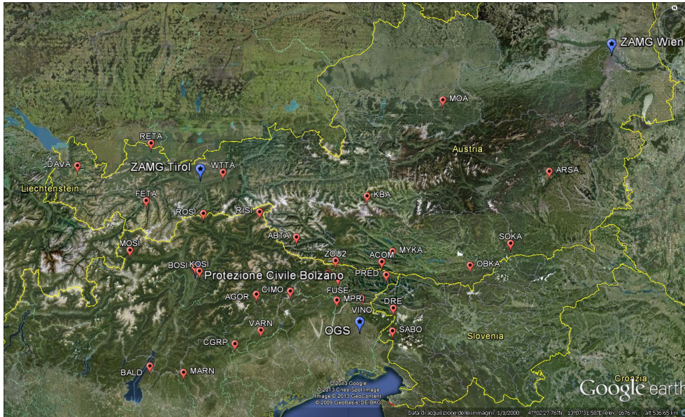
Figure 2. Map of seismic stations in red and data centers in blue involved in the SeismoSAT project.