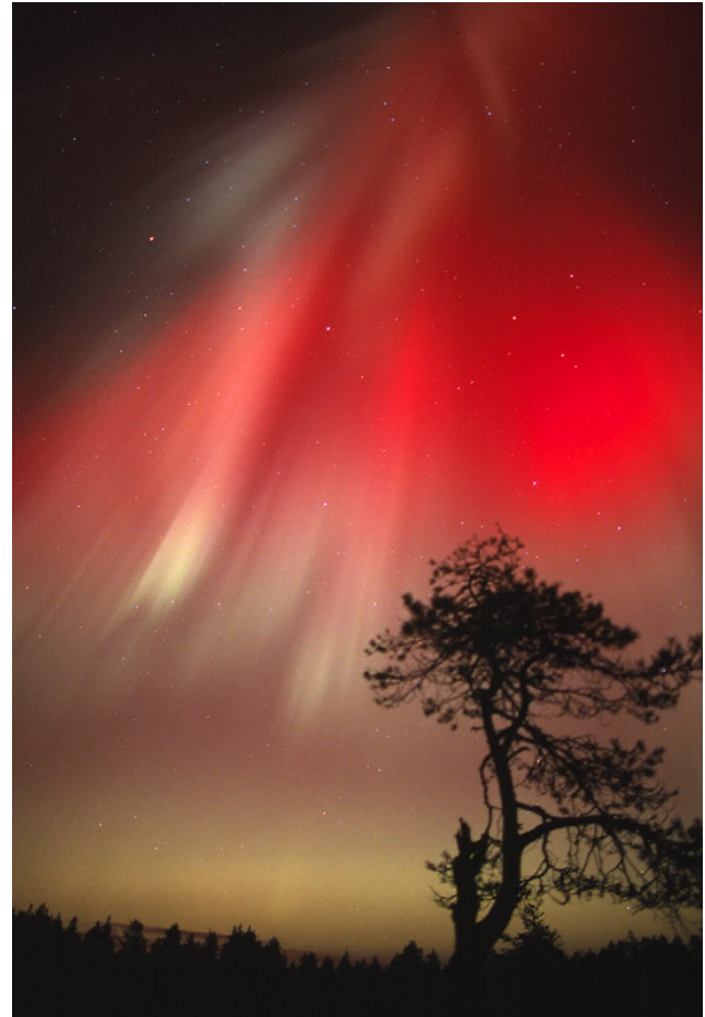
Fig. 2. Auroras in Northern Finland, 21.10.2001.