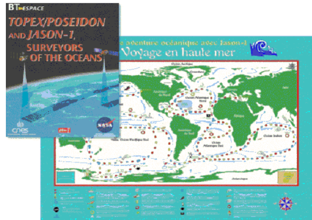
Fig. 3. A French book for children translated into English, and a JPL board game translated into French . . . cooperation in Education is going both ways across the Atlantic.

CNES developed an educational project, named “Argonautica”, that proposes an innovative working environment and new ways of using satellite data [Canceill et al, 2003]. It provides a framework for science teaching in schools based on the theme of oceanography, climate, and tracking of an-