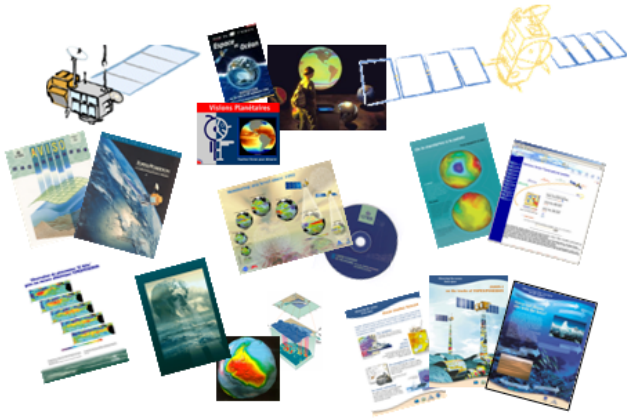
Fig. 2. A potpourri of AVISO outreach realization or participation between 1992 and 2002.

Several series of fact sheets have been published throughout the mission. The project web site, rolled out in 1995, has progressively added new features for users, including an online product catalog, as well as information for the wider audience interested in Earth sciences and oceanography. It is now the major medium for outreach, continuously updated, with news, new information and updated features.