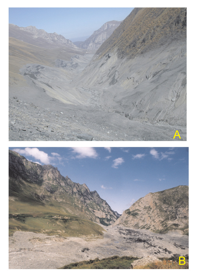
Fig. 2. (A) travel path of the Kolka-Karmadon glacier avalanche flow. (B) Karmadon depression filled by debris-covered ice, two years after the disaster.

During the second and main stage of the movement, the ice/water/rock mass moved from one valley side to the other within a belt 400–500 m wide. The moving mass left asymmetric superelevations up to 250 m in height (Fig. 2a). A