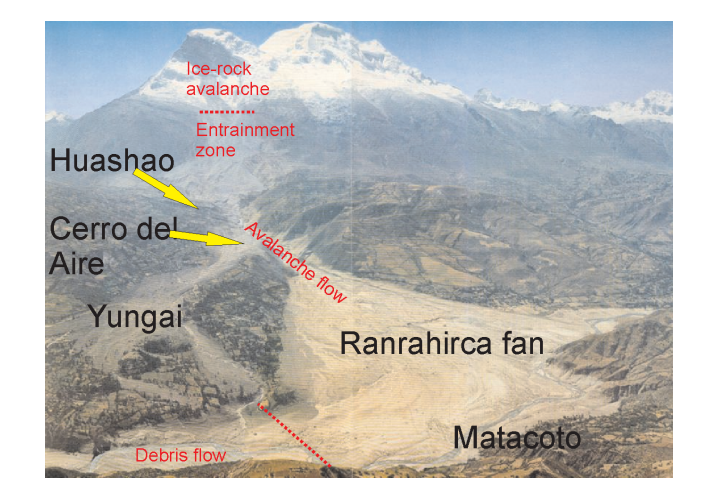
Fig. 3. Huascaran glacier disaster of 31 May 1970: typical case of a glacial multi-phase mass movement.

The Parraguirre event began as a rockslide with a volume of 6 \,\mathrm{M}\,\mathrm{m}^3 and the process quickly transformed into a rock avalanche (Casassa and Marangunic, 1993; Hauser, 2002). Within 5 km from its source the avalanche developed into a great debris flow due to incorporation of glacier ice and